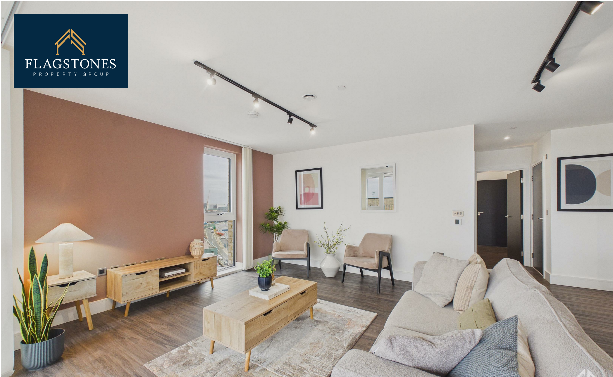
2331 Waterway House, North Kensington, West London, London, NW10 6RH £2,600